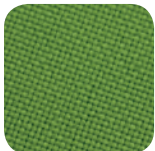
TABLE COVER MATERIAL

★ POLYESTER POPLIN Wrinkle-resistant, durable fabric.