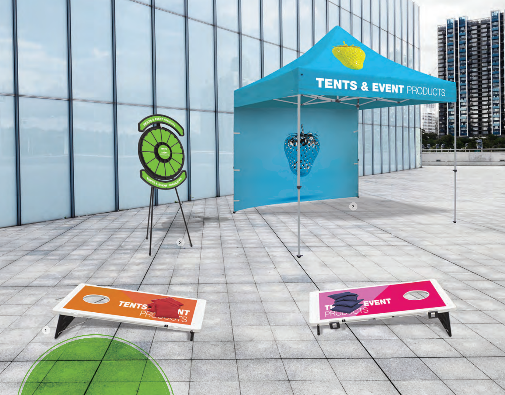
1. Bag Toss page 101 | 2. Spin 'N Win Prize Wheel Plus page 100 | 3. Deluxe 10' Tent with Full Wall page 81 & 90